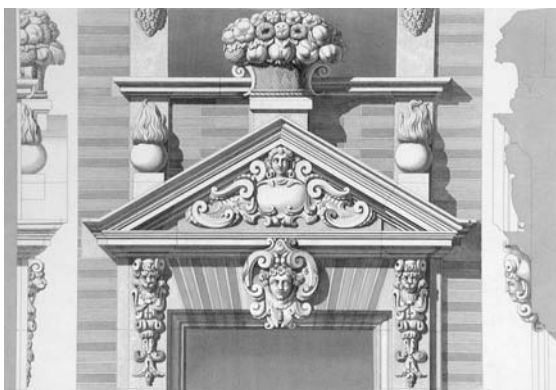
Style Louis XIII, Hôtel Palaminy... à Toulouse. [c1880]. 12 ¼" x 17 ½" (sheet). steel engraving. Paris: Motifs Historiques.