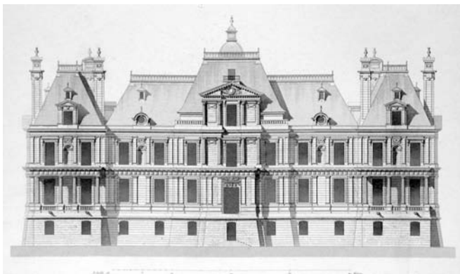
Château de Maisons-Sur-Seine, Façade sur la Seine. [c1880]. 11" x 15" (sheet). steel engraving. Paris: Palais et Château de France.