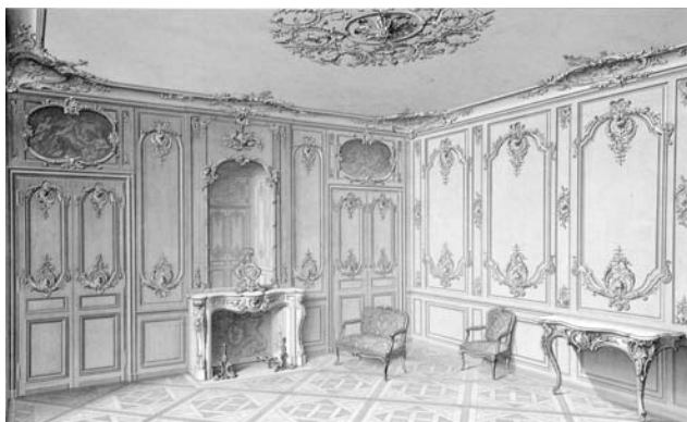
Style Louis XV... Hôtel Cours d'Albret, à Bordeaux. [c1880]. 12 ¼" x 17 ½" (sheet). steel engraving. Paris: Motifs Historiques.