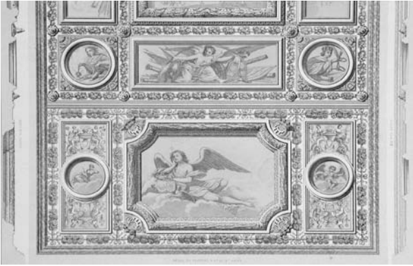
Style Henri IV... Cabinet, dit de Sully... l'Arsenal, à Paris. [c1880]. 12 ¼" x 17 ½" (sheet). steel engraving. Paris: Motifs Historiques.